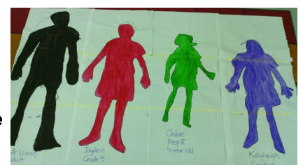
An outline of people we traced during inquiry.