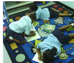
Students making connections between text and self.

Inquiry —We investigated the different needs and wants we have as we progress through different stages of our life. We found out that people are different in size at different stages. We traced several people onto life size posters to see the difference in size, height and made predictions about how we would look like as we grow older. We are about to start our investigation on how plants and animals change from their different stages as well. Briannah predicted that the stages of plants and animals are not the same as that of humans. We hope to find some answers to all our wonderings about plants and animals very soon.